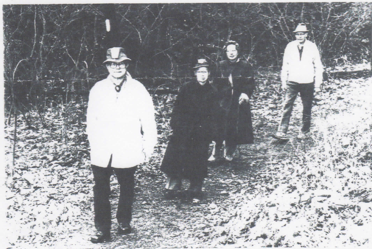
TESTING OUT THE TRAIL