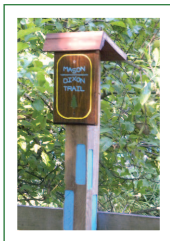
The new sign (above) and the post at Murphy's Hollow Side Trail (below)

The first of these new signs was installed in the Wrightsville area and this becomes the second part of the Mason-Dixon initiative. Organized work trips are now being planned for a weekend day during each month (more or less) and are open (as always) for the public. The effort is two fold. One, there is an open invitation for