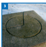
3 Arc Corner Marker in White Clay Creek SP (slightly off trail) Map 9 Mile 13.9 (W to E) Mile 4.9 (E to W)