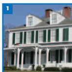
1 Principio Furnace Ironmasters Mansion Map 7 Mile 6.7 (W to E) Mile 8.0 (E to W)

Thanks to all who submitted their guesses to last issue's photo challenge. Although we had no clear winner, we had several people get one right or a couple partially correct. Stay tuned for more challenges in future issues—in the meantime keep hiking and looking around!