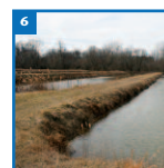
6 Fish Propagation Ponds near Elkton Map 8 Mile 13.3 (W to E) Mile 2.8 (E to W)

The M-DTS Newsletter is published about four weeks in advance of each of the four M-DTS board meetings held annually. Submissions are welcomed.