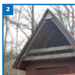
2 Barred Owl Nest in Elk Neck State Forest (slightly off trail) Map 8 Mile 3.1 (W to E) Mile 13.2 (E to W)