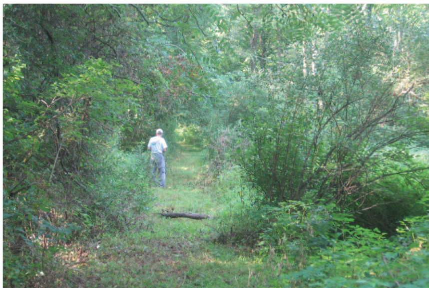
Image from the relocation of the trail in Game Lands 242

http://legis.delaware.gov/LIS/lis146.nsf/vwLegislation/SJR+6?OpenDocument