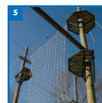
5 Training Course Map 9 @ Mile 11.7 (W to E) @ Mile 7.2 (E to W)