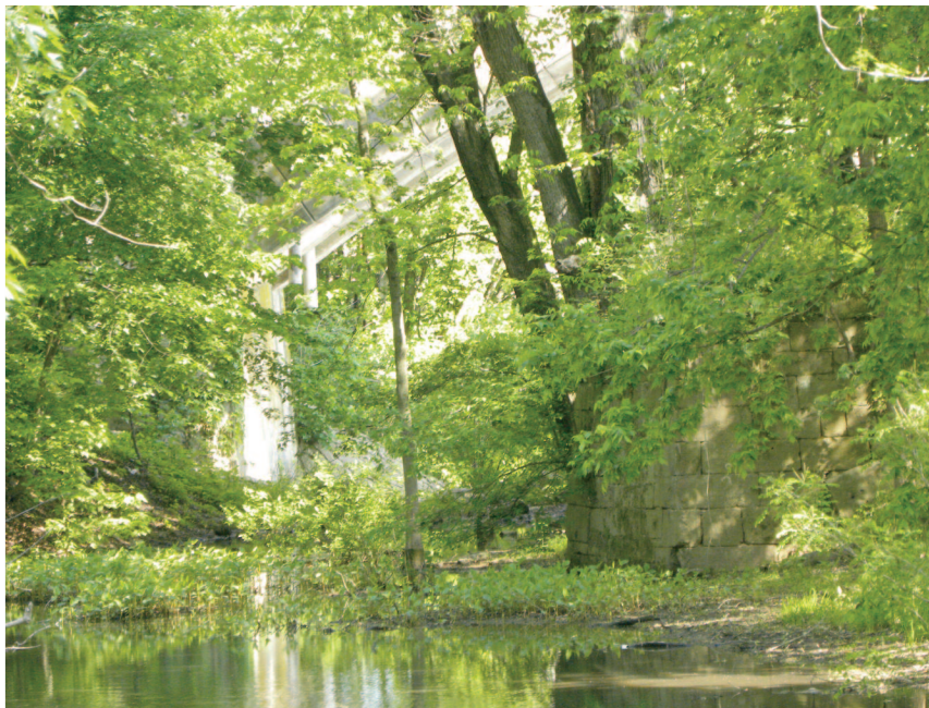
Wrightsville end of canal

pulled the boats across the river. During the boom years Wrightsville was a transshipment point for lumber and coal.