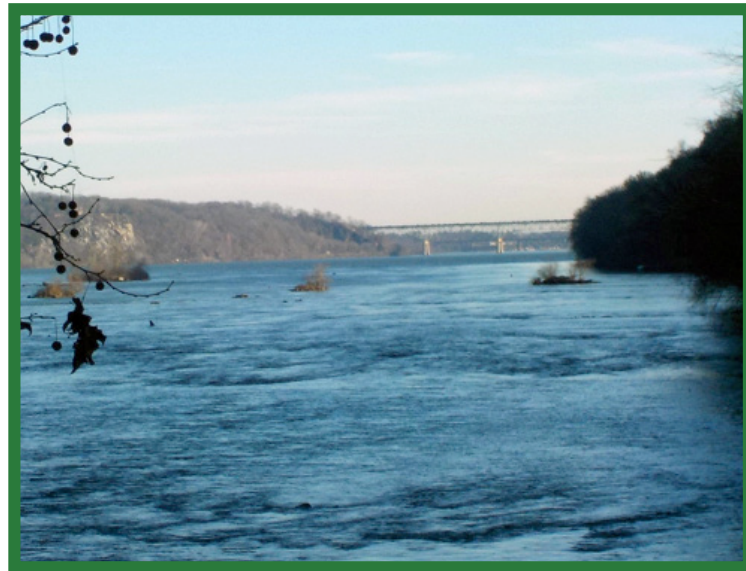
Millard Tydings Memorial Bridge