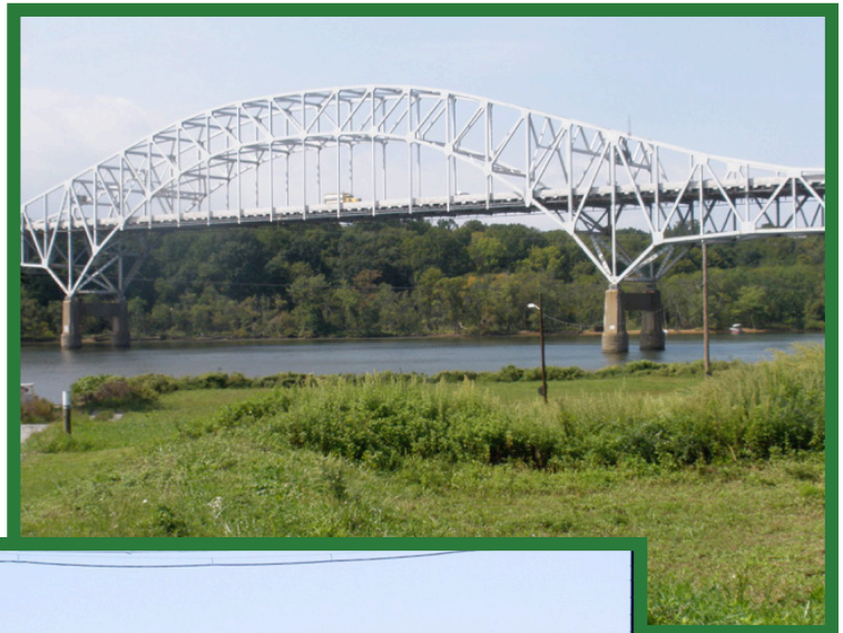
Rt 40 Bridge