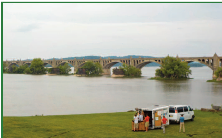
The old Civil War bridge piers alongside the current bridge.

Lee sent Major General Jubal Early's division to York County. One of his brigades was Brig. Gen. John Gordon's brigade. His brigade was sent to York City. After ransoming the city of York, Gordon proceeded toward Wrightsville on what is now Rt 462.