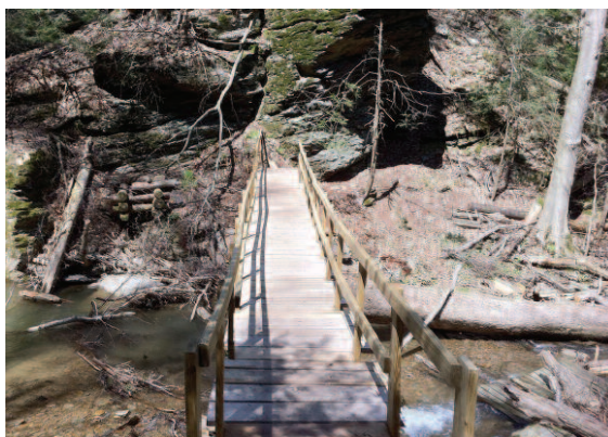
The rebuilt Sawmill Run Bridge