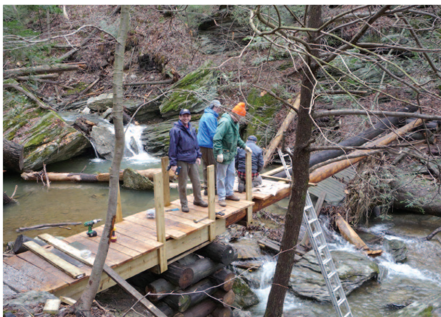
York Hiking Club crew working on bridge